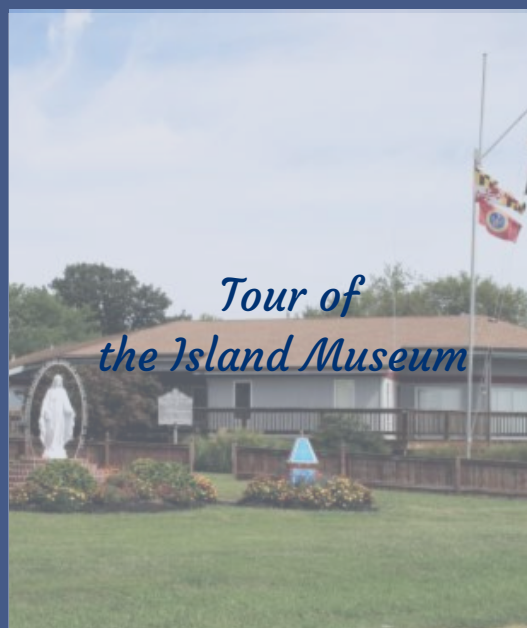
Tour of the Island Museum