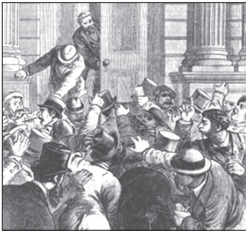
Wall Street as depicted during the Panic of 1873

The post-Civil War Panic of 1873 was a financial crisis that triggered an economic depression in Europe and North America that lasted from 1873 to 1877, or 1879 in France and in Britain. In the United States, the Panic was known as the "Great Depression" until the events of 1929 and the early 1930s created a new yardstick for measuring widespread economic decline.