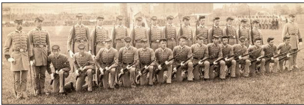
Saint John's Academy Cadets, Alexandria, VA, c. 1860

Although their names are only mentioned twice in our old parish records, since they were not priests and did not administer the sacraments, Jesuit brothers served at Saint Mary in the early 1800s.