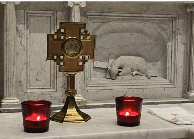
Relic of Saint Vincent de Paul venerated at the Basilica of St. Mary on his feast day, September 27.

We maintain a separate fund for such cases and donations can be made specifically for the Sustainment Fund.