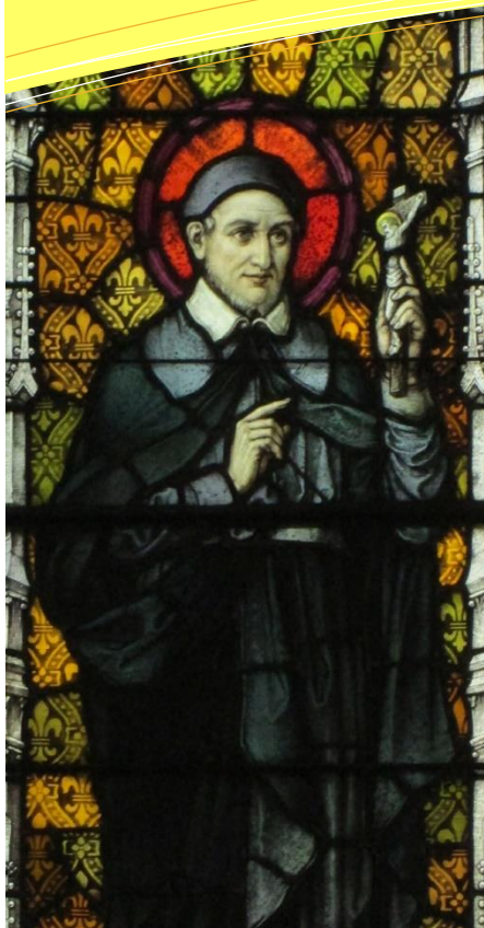
Stained-glass image of St. Vincent in the Basilica of St. Mary.

St. Mary Conference ♥ Basilica of St. Mary, Alexandria, Virginia